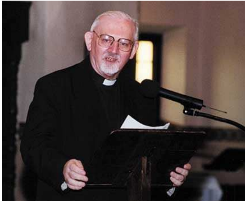
Peter-Hans Kolvenbach, Superior General of the Society of Jesus (The Beast)

Amazing, huh? The White Pope (Beast #2) says he's Jesus Christ, and the Black Pope (Beast #1) claims to be the Ghostly Father or God Almighty. In fact just so you can feel the spirit of this Roman Catholic Black Pope "god" - the one whose been duly elected for this great end-time event of the Antichrist - his name is Peter-Hans Kolvenbach, and his face looks something like this: