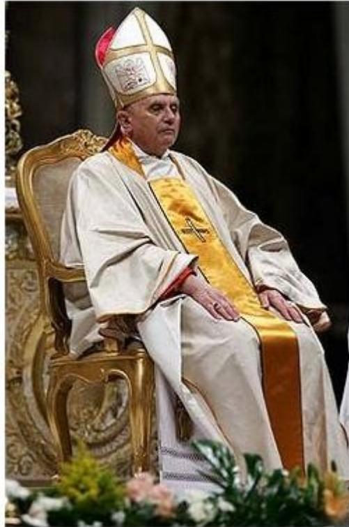
Pope Benedict XVI (The False Prophet – elected 4/19/05)

So what do you think about that? The White Pope "antichrist" says he's Jesus Christ! But what about the Pope that's "dressed in black"?